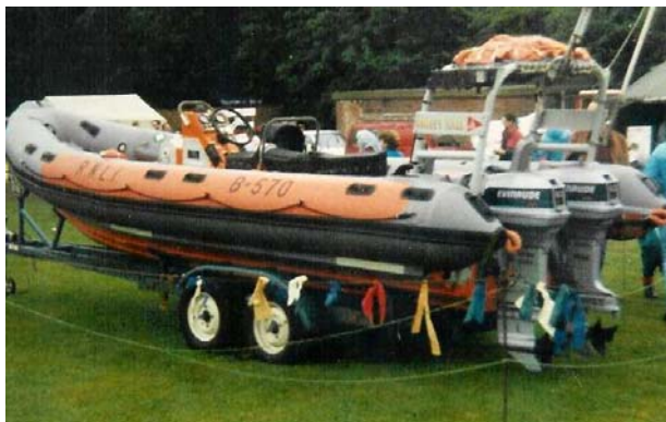
The Himley Hall Lifeboat